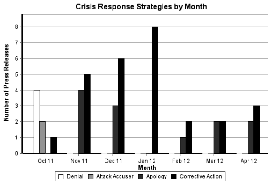
Figure 1 Code Category: Olympus CRS - CRS by Month [Olympus Press Releases]

Olympus incurred additional ire when an internal memo penned by Kikukawa was leaked to The Financial Times . In what the Western media calls a "diatribe" and "vitriolic" Kikukawa leveled various accusations at Woodford, ranging from "being something of a control freak" to "poor temper control, lack of respect for reporting lines, and overly indulgent use of private jets" (Clark, 2011; Mure, 2011). In the most personal attack of the