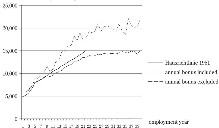
Graphic 1 The Hausrichtlinie and the effective annual salary of the chemists in the Bayer-headquarter Leverkusen in 1951 (Deutsche Mark)